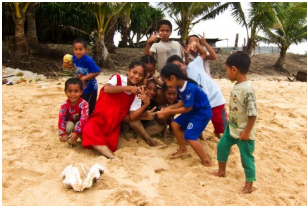
Children in Matuu Island, Ha'apai Group