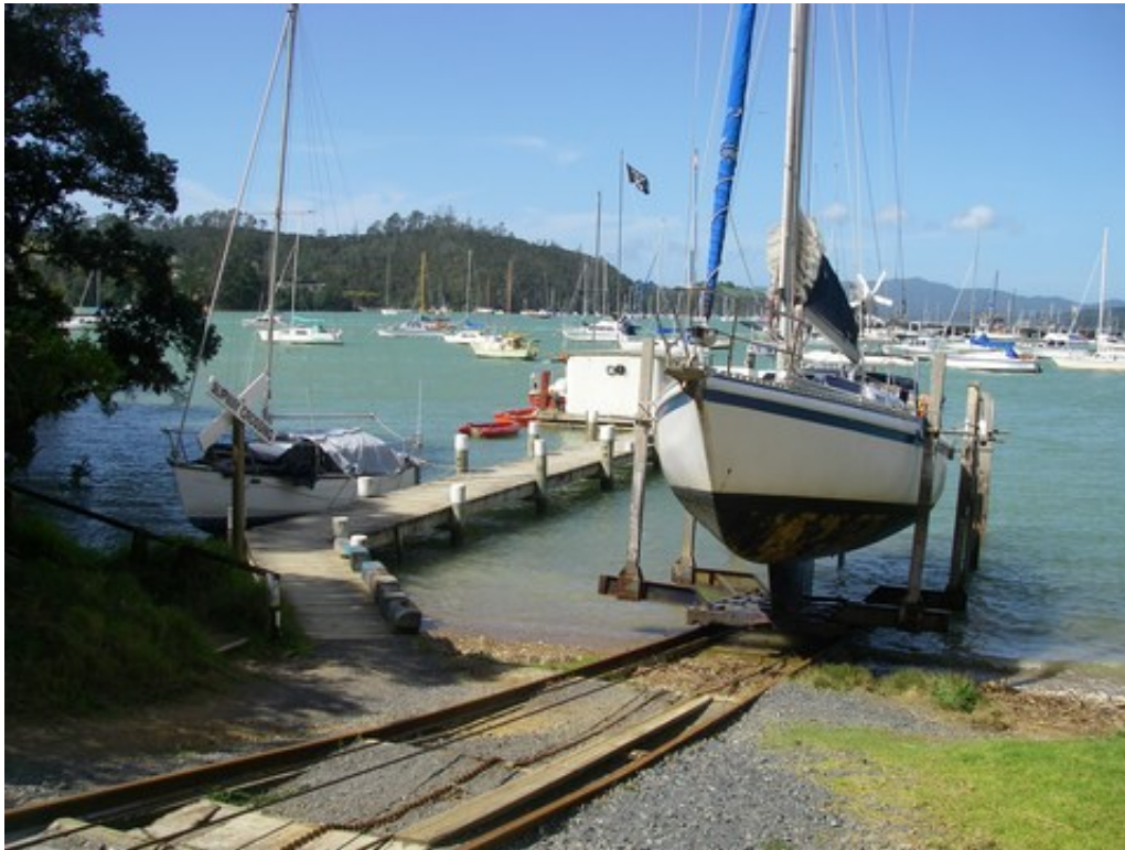
Schnaps is being lifted out of the water on the rails